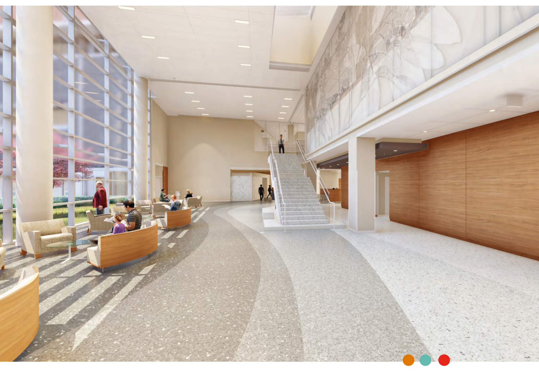
FIRST FLOOR LOBBY