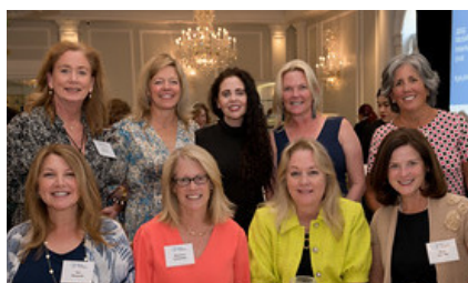
More than 200 women attended the annual Women For Health Luncheon at the Rockleigh Country Club on May 10.