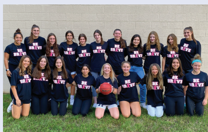
Indian Hills High School Girls' Basketball