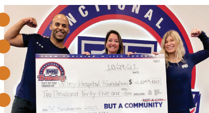
F45 Training North Paramus