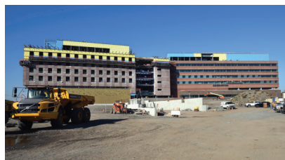
Construction progress at The Valley Hospital in Paramus

Because our project team had the forethought to pre-order key materials and equipment, we have avoided many of the supply-chain issues that have recently come to light. The project is on schedule, with a planned opening in late 2023.